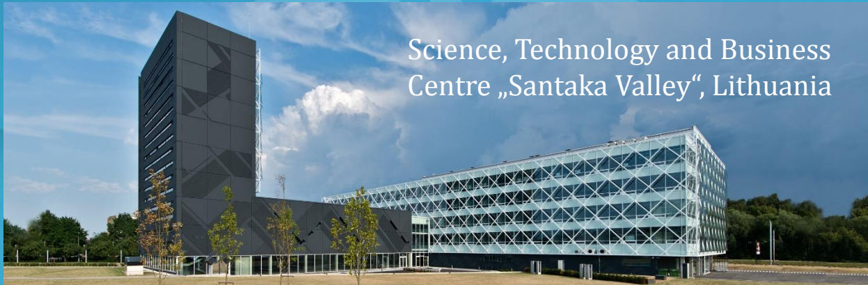
Science, Technology and Business Centre „Santaka Valley“, Lithuania